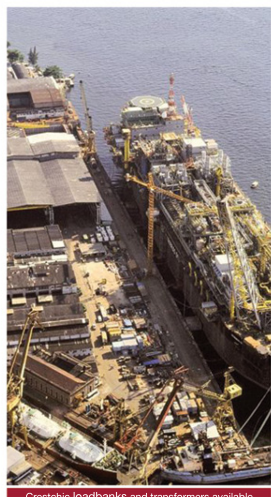
Crestchic loadbanks and transformers available for sale or rental